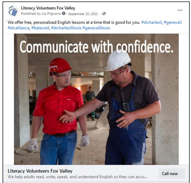
Facebook posts address the concerns of adults who speak limited English.