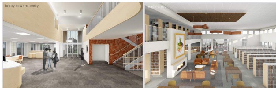
Lobby looking toward new entry and reading room Concept designs by Sheehan Nagle Hartray Architects