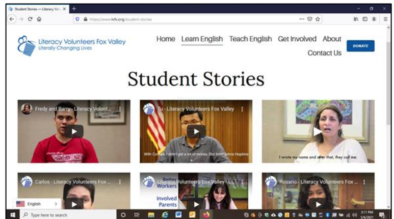
Videos have been uploaded to various pages so you can "meet" our tutors and students.

We are grateful to the many students, tutors, and supporters who agreed to have their images posted to the website. Our diverse population is well-represented.